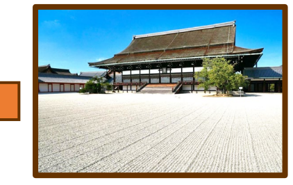
11:15-12:30 Kyoto Imperial Palace

Application: Nov. 2 (Thu.) 12:30 - Nov. 27 (Mon.) 17:00